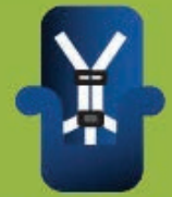
Forward-facing Car Seat

It is best to keep kids forward facing in a car seat with a harness as long as they are within the weight and height limits for the car seat. The harness in a forward-facing seat protects the child by contacting the strongest parts of the body and spreading crash forces over a wide area.